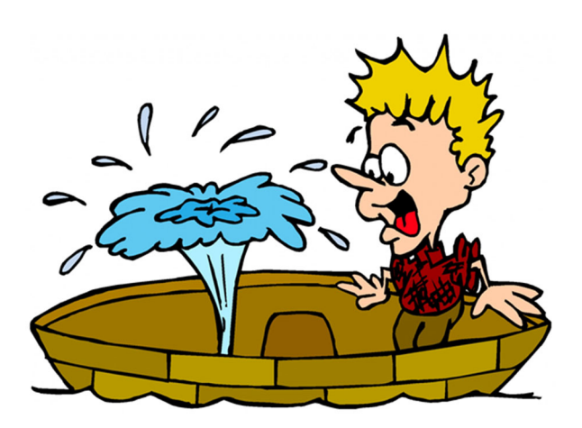
DEFINITION OF BOAT: A hole in the surface of the water into which money is thrown