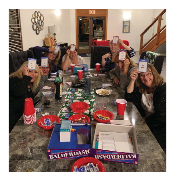
Archive Photo—The Sheets, June 2019

Although the Commodore's Cruise to the BVI is not until October 19, we are putting captains and crews together and reserving boats now. A $500.00 is required by February 15 to reserve your cabin. There is no better location for this sevennight cruise than the BVI. Don't be left on shore.