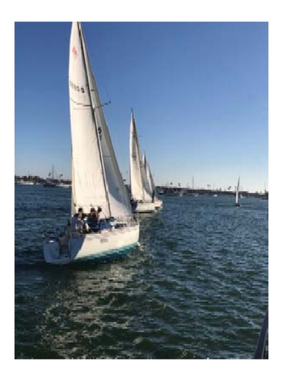
The start of the Hibachi Race