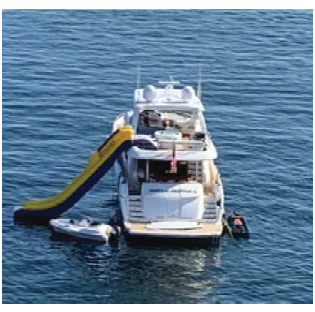
For next year?

Saturday afternoon, several members were seen near Arearea drinking homemade pain killers, while floating on a big white unicorn or chilling on the lily pad. Yes, there really was a big white unicorn siting! What does the big white unicorn look like? You need to come to 2020 Shrimptastic to see. On a side note, I think I had the best entry onto the unicorn, as I lead with my face going into the water at the bottom, I mean I was demonstrating what NOT to do!