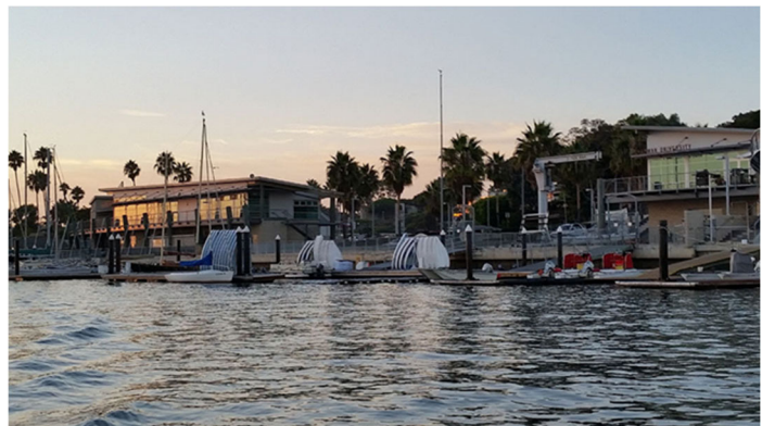
Newport Sea Base in 2010!