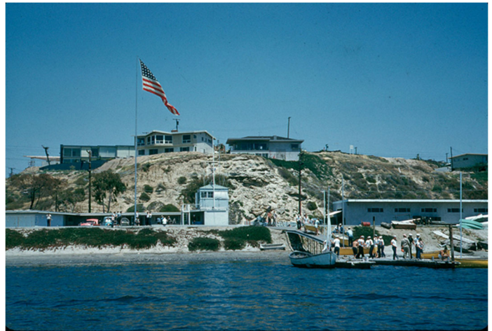
Newport Sea Base in 1950s

The Newport Sea Base's early beginnings came out of public support in 1937 when the Boy Scouts of America, Orange County Council signed the initial 25-year lease for the property. The Newport Sea Base and the Sea Scouts have gone through many developments since its origination. In 1947, funds were collected to build the first facility that included a clubhouse with restrooms and showers. By 1961, the number of youths utilizing the facility daily increased to over 2,100 per year and by 1969 soared to 12,000.