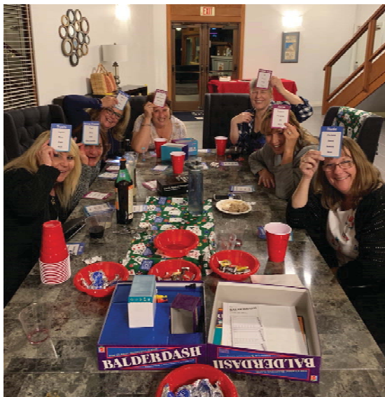
Archive Photo—The Sheets, June 2019

Although the Commodore's Cruise to the BVI is not until October 19, we are putting captains and crews together and reserving boats now. A $500.00 is required by February 15 to reserve your cabin. There is no better location for this seven-night cruise than the BVI. Don't be left on shore.