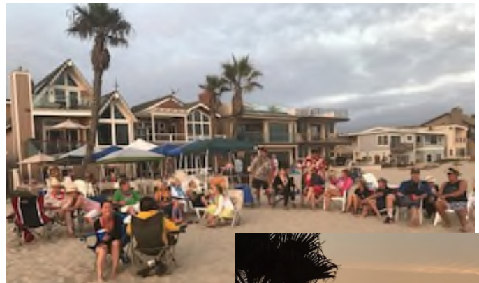
Endless Beach Party 2017

Enjoy your boating this August while the weather is great. But the good times don't have to end. September 15 is the Endless Beach Party.