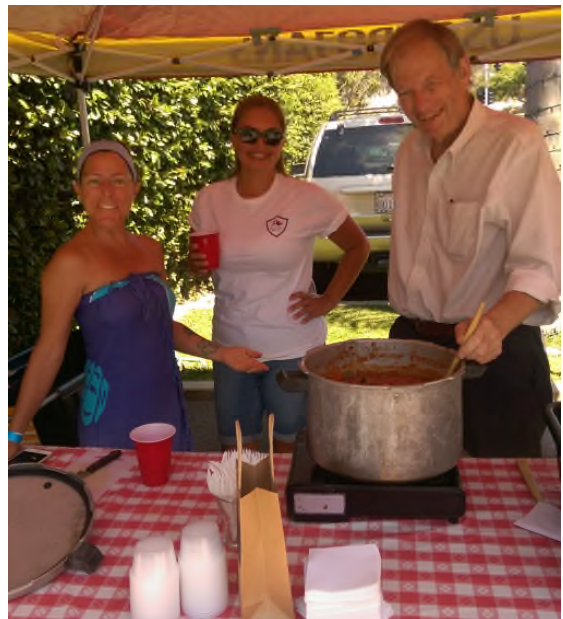
2015 NBYC Chili Cook Off

8. The decision of the Chief Judges shall be final PLEASE NOTE: Worst thing is to run out of chili before the end of the event. Manage the amount of chili served. Please and Thank you.