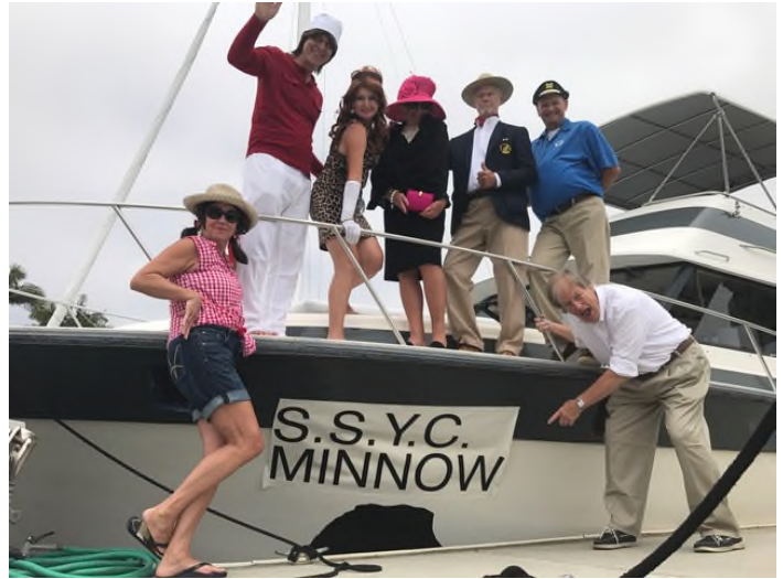
"Dickie Boy" alter-ego, "SSYC Minnow"