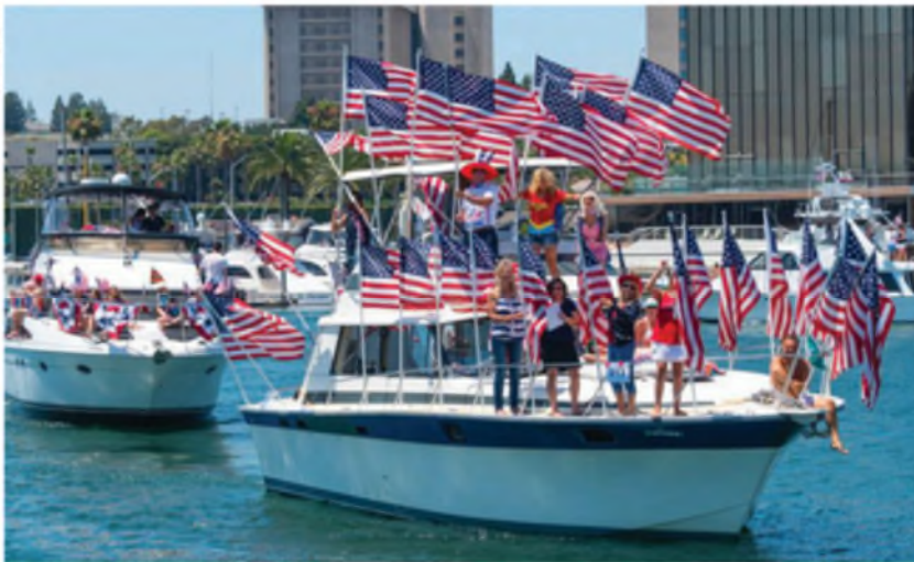
Patriotic boats cruised through Newport Harbor as part of the Old Glory Boat Parade on July 4. See page 15 for more July 4 photos.