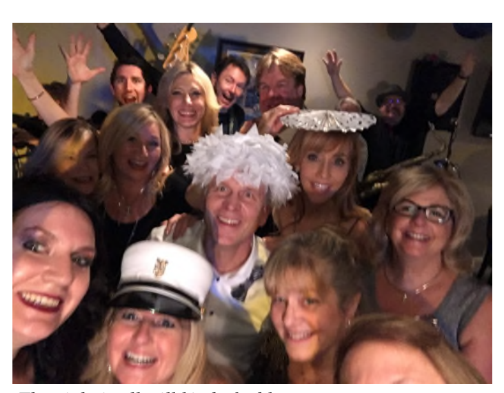
The night is all still kind of a blur...

committed to_promote boating by planning races, cruises and have interesting events. If you do not participate, you will be missing out on some fun